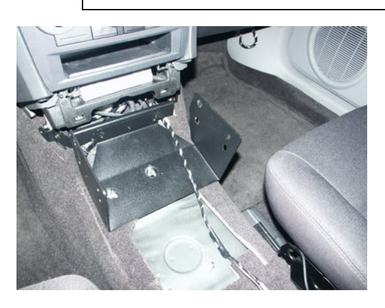
View of installation to this point Note: Be sure OEM wiring is not being crushed by mounting brackets

Note: Due to some slight differences on the OEM floor mount bracket, tabs with mounting hole may need to be bent slightly to accommodate the console front support bracket. Bending these tabs can easily be done using pliers.